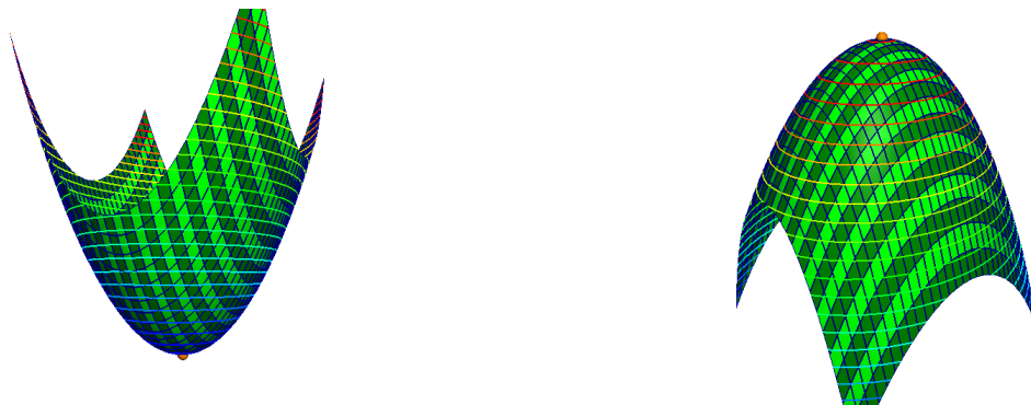
Figure 1: Case D1 of the second derivative test, both possibilities.

In the vicinity of a relative maximum or minimum value (i.e., case D1 of the second derivative test) the graph of a function z = f(x, y) will have one of the shapes below.